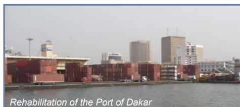
Rehabilitation of the Port of Dakar