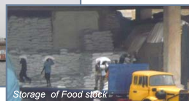
Storage of Food stock